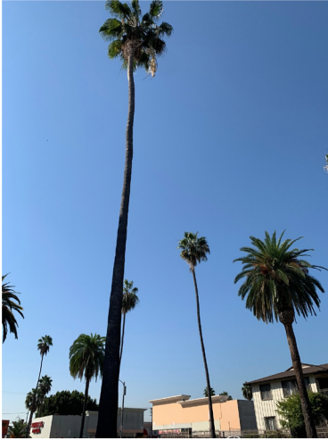
1. Washingtonia robusta (Mexican Fan Palm) In public right of way on parkway to be retained and protected in place. DBH: 16"