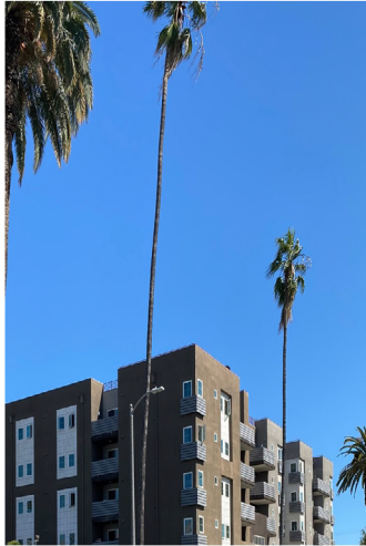
2. Washingtonia robusta (Mexican Fan Palm) In public right of way on parkway to be retained and protected in place. DBH: 14"