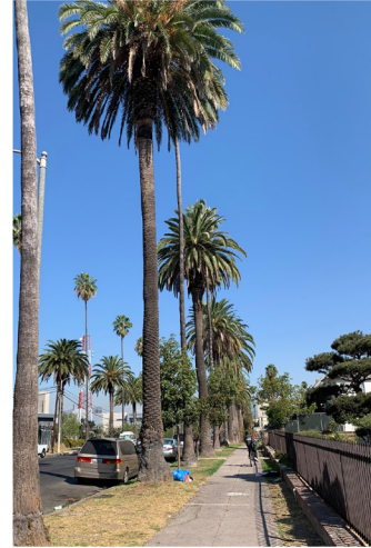
3. Phoenix canariensis (Canary Island Palm) In public right of way on parkway to be retained and protected in place. DBH: 26"