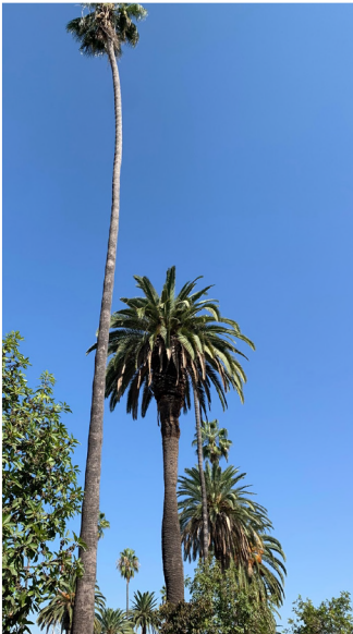
4. Washingtonia robusta (Mexican Fan Palm) In public right of way on parkway to be retained and protected in place. DBH: 14"