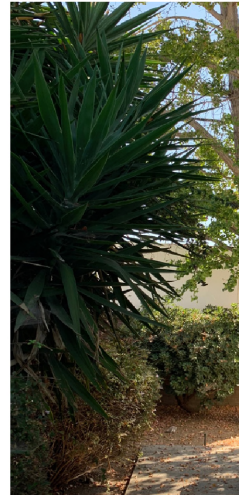
9, 10, 11. Cordyline aus- tralis (Cabbage Palms) to be removed. DBH: 30", 18", 24"