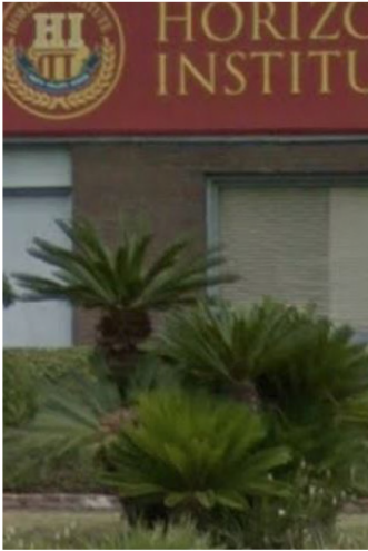
7. Phoenix roebelenii (Pygmy Date Palm) to be removed. DBH: 12"