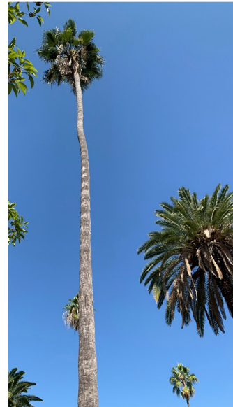
6. Washingtonia robusta (Mexican Fan Palm) In public right of way on parkway to be retained and protected in place. DBH: 16"