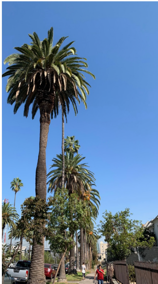
5. Phoenix canariensis (Canary Island Palm) In public right of way on parkway to be retained and protected in place. DBH: 26"