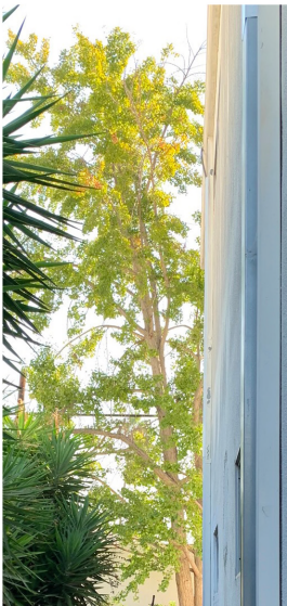
12. Ginkgo biloba (Maidenhair Tree) to be removed. DBH: 12"