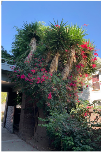
8. Cordyline australis (Cabbage tree) to be removed. DBH: 30"